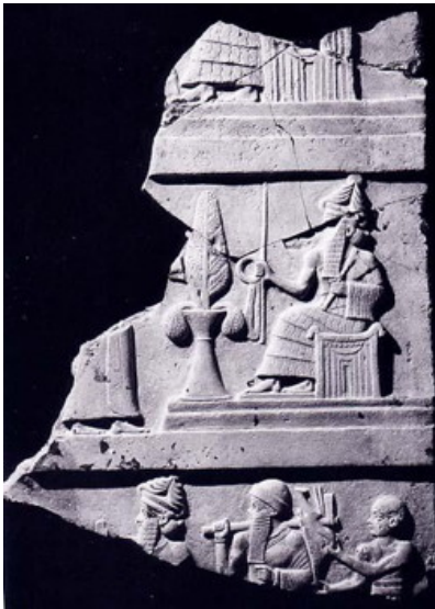
Possible depiction of the god Nanna, seated on a temple-like throne, on a fragment of the Stele of Ur-Namma at the University of Pennsylvania Museum of Archaeology and Anthropology (object number B16676.14) (ca. 2100 BCE). The stele was excavated at Ur.

Mesopotamian moon god. He was called Nanna in Sumerian, and Su'en or Sin in Akkadian. The earliest writings of both are roughly contemporary, and occur interchangeably. An additional name, which is only attested in literary texts, is Dilimabbar. The true etymologies of both Nanna and Su'en remain unclear ( Krebernik 1993-98b : 360-64).